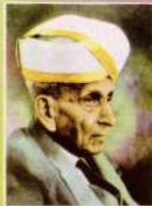
Sir M. Visvesaraya 35