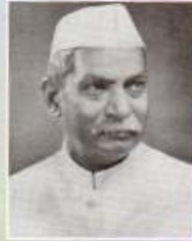
Dr. Rajendra Prasad 11