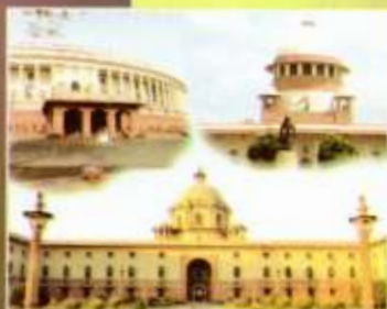
Four Pillars of Indian Democracy 42

All published material in SCHOLASTIK WORLD are the personal views of the authors. The Editorial Board and Publishers will not be held responsible on that count.