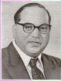
Dr. Babasaheb Bhimrao Ambedkar 05