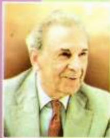
J.R.D. Tata 23