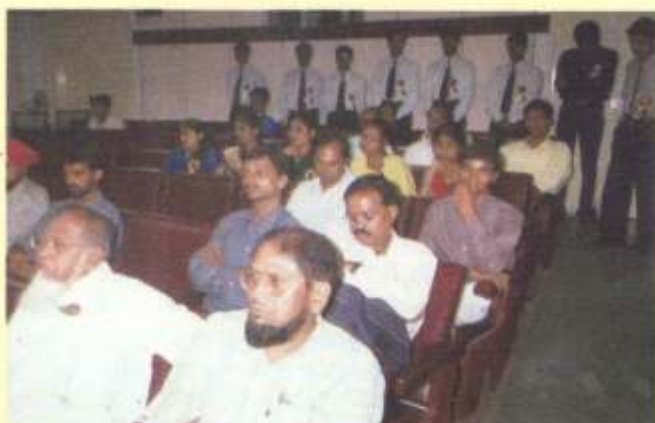
View of the gathering